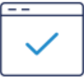
Review & Approval