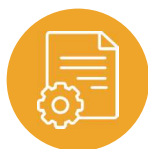
Identity & Access Management