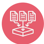
Data Import/ Export

Intelex also provides the following features as part of its industry leading Platform: