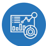
Embedded BI/ Analytics