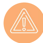
Risk Matrix Designer